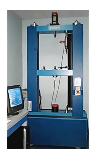
Fig. 2: Specimens being loaded in the universal testing machine